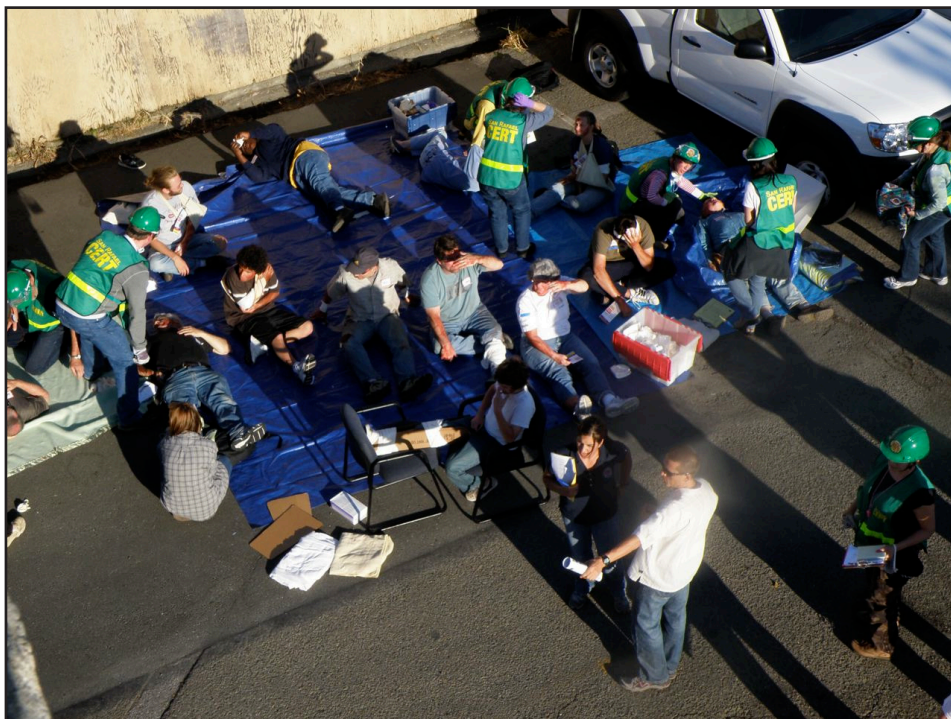
CERT graduates learn about emergency preparedness in a real life simulation.

The Board of the Montecito Area Resident's Association feels so strongly about the value of CERT training that they will reimburse MARA members who participate 50 percent of the cost up to $50 upon completion of the course and presentation at a monthly board meeting of the certificate