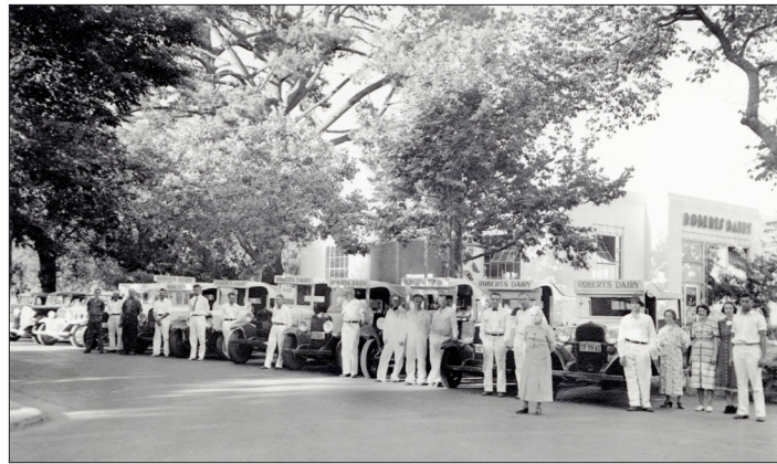
Dairy trucks on Mary Street at the creamery in 1938.

The original family home is at 50 Mary Street. Legend has it that John Paul Chase, who rode with gangster Baby Face Nelson